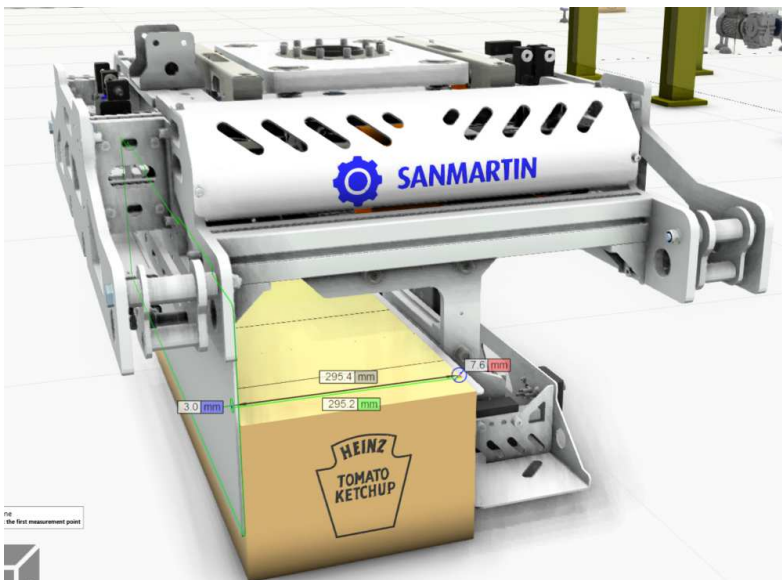
Tool with transverse boxes 296 mm opening